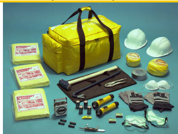
Rescue equipment for 1-50 persons