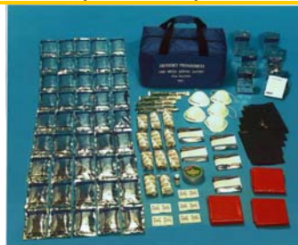
Food, water & basic survival supplies for 5 persons for 3 days