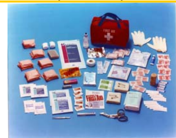
Basic survival first aid supplies for 1-25 persons